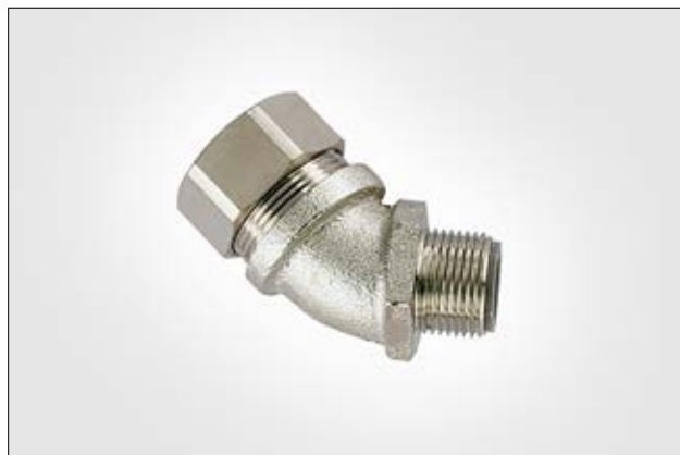
HeliaGuard LTS-45FMC 45° Elbow Compression Fitting.