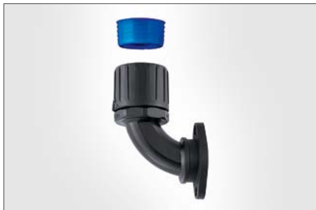
HelaGuard HGL-90FL 90° Elbow Swivel Flange, IP68.