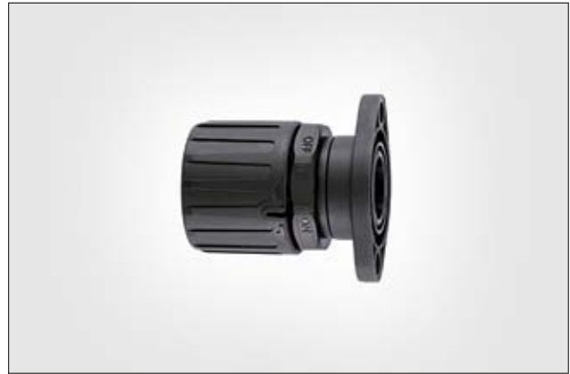
HeliaGuard HG-SFL Straight Swivel Flange, IP66.