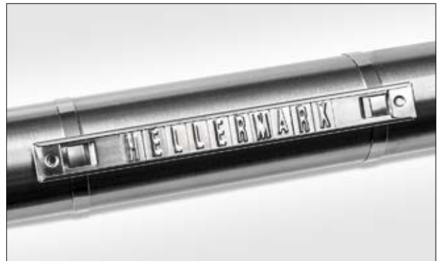
Hellermark SSC and SSM.