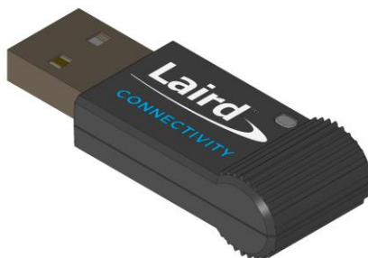
Wi-Fi 5 Dual band USB Adapter (Dongle)

Laird Connectivity's customers asked for a robust packaged adapter: one that's rugged, small, simplifies their BOM, is globally certified, has reliable connectivity, and easy to integrate. Our new Sterling-LWB5+ USB Adapter is the latest member of the successful Sterling-LWB5+ radio family, based upon the Infineon CYW4373E chipset.