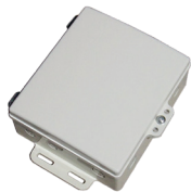
• DCE 7x6x2

The Die-Cast Enclosure (DCE) series offers a directional VPOL panel antenna that is contained within a die-cast aluminum enclosure. The enclosure adds to the long life of the antenna in outdoor environments. The powder coat paint over aluminum construction offers unsurpassed resistance to corrosion. The die-cast enclosure has extra heavy duty mounting flanges for reliable mounting to poles or surface mounting to walls along with the inclusion of seven engineered hole knockouts which allow for many different configurations of connectors and feedthrus without the need for drilling holes.