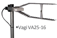
• Vagi VA25-16

The Vagi/Yagi Series are rugged, easy-to-install, high-gain directional antennas used in a wide variety of wireless systems where low cost, good performance and low wind loading are important factors. They include either a VPOL or HPOL configuration, along with a 1.5 VSWR as well. These antennas can be pole mounted in outdoor environments.