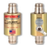
Lightning Arrestor LABH350NN (Sold Separately)