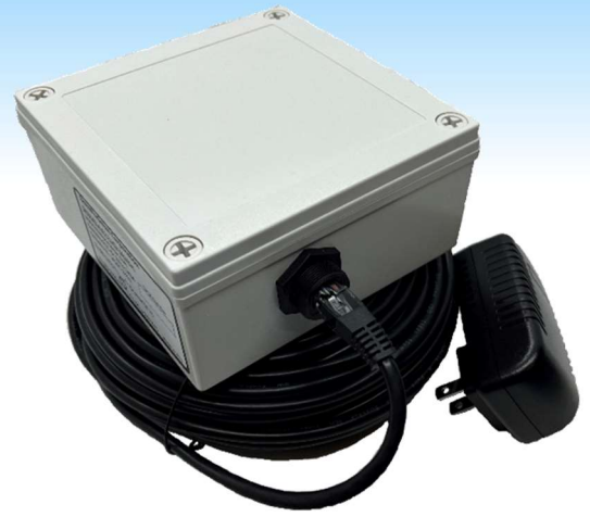
OPS8243 Traffic Monitor (WiFi version shown)