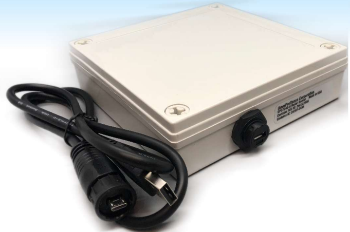
OPS7242 Radar Sensor