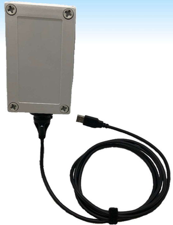
OPS7242 Radar Sensor