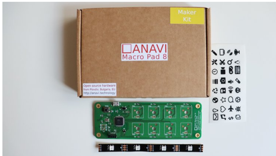
Figure 4: ANAVI Macro Pad 8 Maker Kit

programmed with whatever information you want through Arduino IDE.