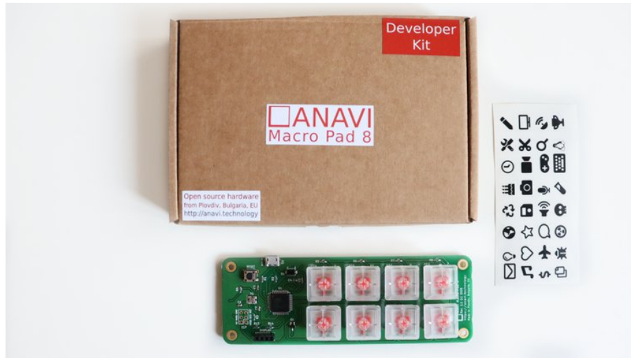
Figure 3: ANAVI Macro Pad 8 Developer Kit

The Developer Kit does not require any soldering. It features Gateron red mechanical switches and translucent keycaps with red backlighting. The Developer Kit is easy to get started with, and it is perfect even for newbies. Just pop the keycaps on, and you're ready to go.