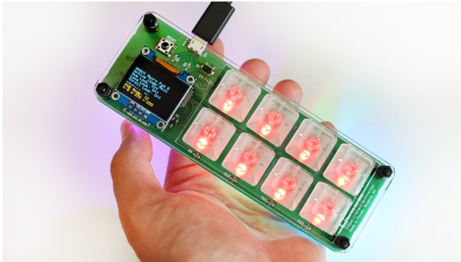
Figure 2: ANAVI Macro Pad 8