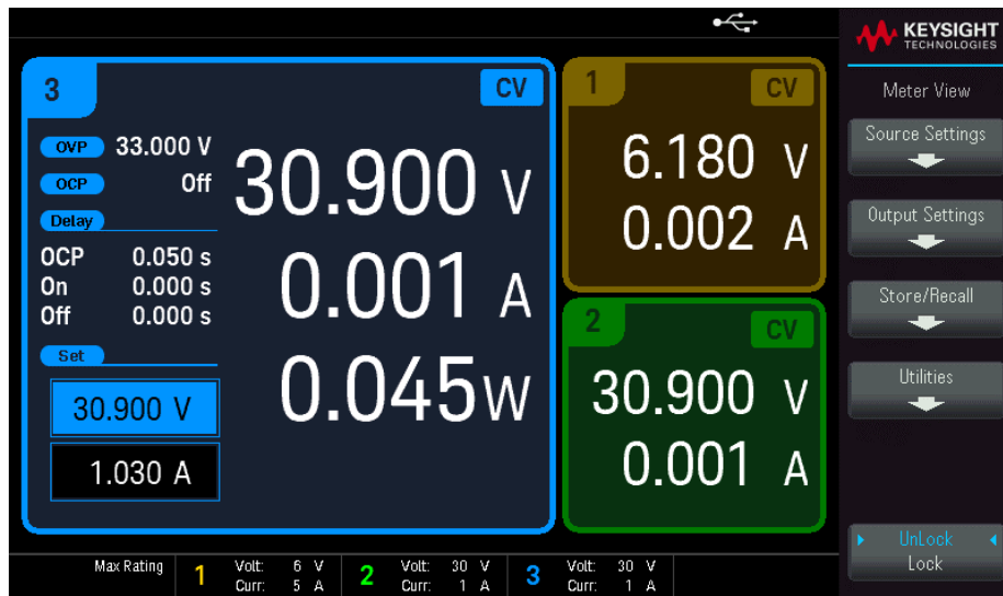
Figure 2. View details of a single channel including the measured power, OVP/OCP condition, and delays.

Figure 2 shows the single-channel view that includes the measured power, OVP / OCP condition, and delays. You can also monitor the readback, voltage and current for the other two channels.