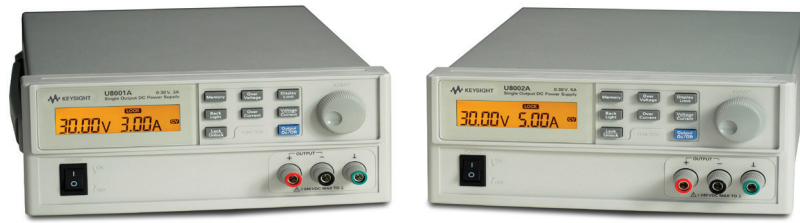
Figure 1. The U8001A 90 W and U8002A 150 W single output DC power supplies