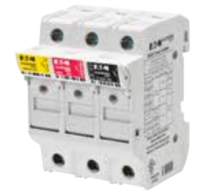
CH modular fuse holder for 10x38 mm fuses - PV (yellow), IEC 10x38 and UL midget (red), and UL Class CC (black)