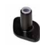
C-Surface Mount Bracket