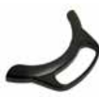
KFM LED Handles