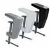
A-Edge Mount Bracket