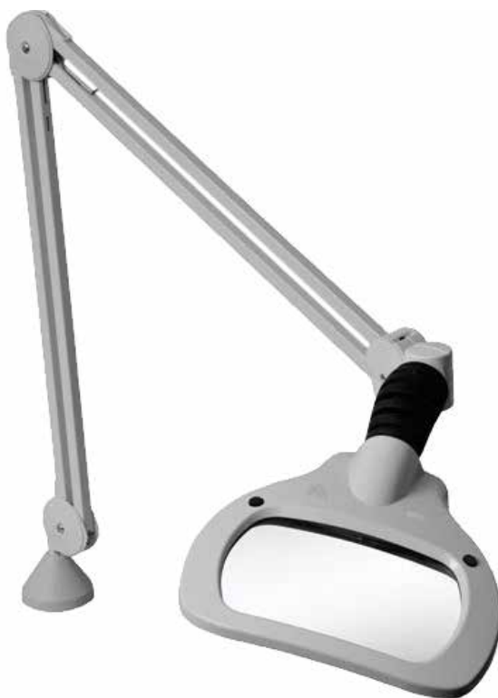
Wave LED / LED ESD / LED UV Magnification

Timer and dimming: Step dimming 0-50-100%. Selectable left / right illumination. Auto shut-off function.