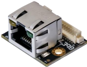
BE323 RJ45 adapter