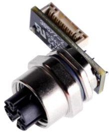
BS441 M12 X-Code adapter