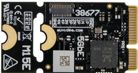
M15E bottom side