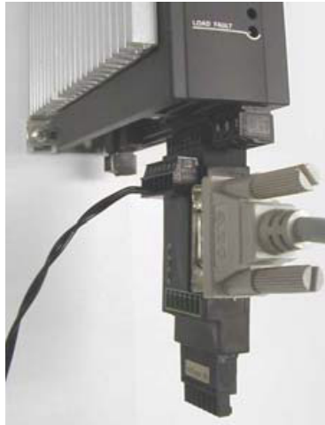
FIG. 1 THYRO-S

The connection of the interface at Thyro-S corresponds to fig. 1. Then the free upper 7-pin row is intended for the plug that was before on the connection present (set point wiring). The plug is to put directly below the Thyro-S from left side on to the interface.