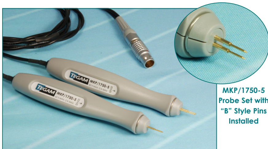
MKP/1750-5 Probe Set with “B” Style Pins Installed

(Pins are not included with the probe set and need to be ordered separately.)