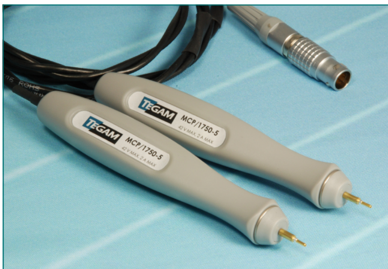
MCP/1750-5 Probe with Coaxial Pins Installed