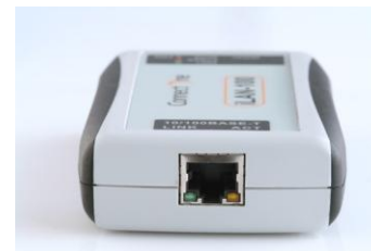
RJ-45 Connector Link and Activity LEDs