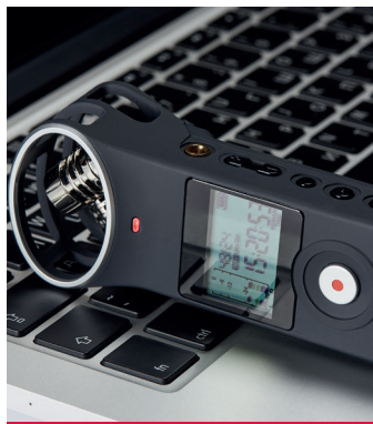
Portable Audio Hardware