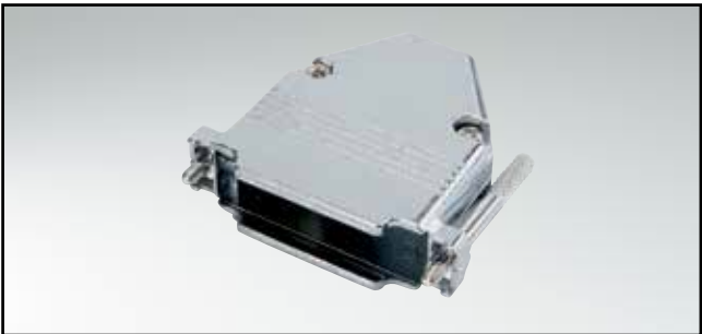
RoHS compliant – CSA listed, File No.: LR 115000-1 – UL listed, File No.: E202784

Straight cable entry – 9-50 pos. – With jack screws