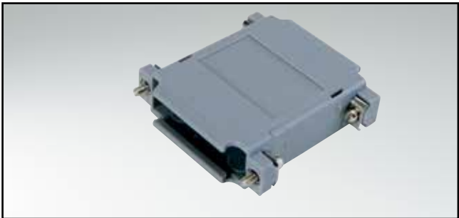
RoHS compliant – CSA listed, File No.: LR 115000-1 – UL listed, File No.: E202784