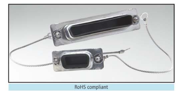
FOR SOCKET CONNECTOR __

Metal design - Shielded - 9-50pos. - Jack screw - Lanyard