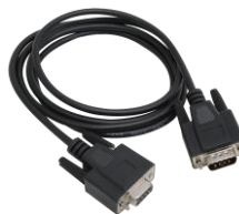
DB9M to DB9F