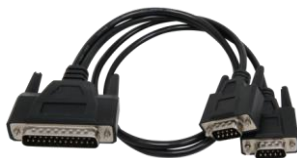
DB25M to DB9Mx2