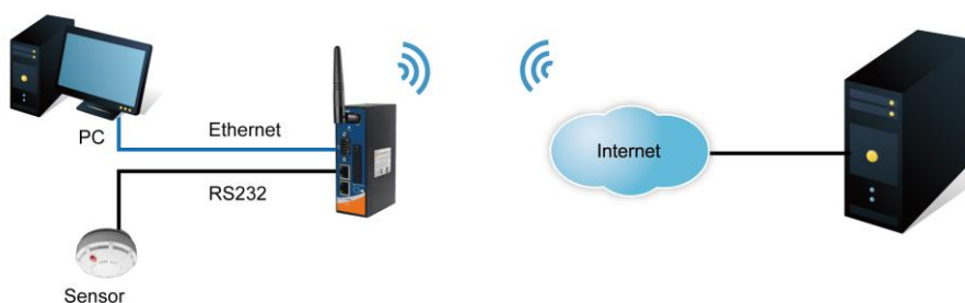
M2M Gateway Connection

IMG-4312-4G support 2G/3.5G/LTE Modem dial up. The utility- M2M-Tool which is used to manage and monitor all of the serial ports on IMG-4312-4G.