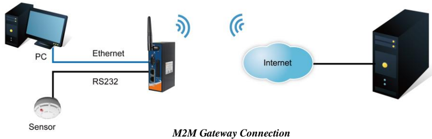
M2M Gateway Connection