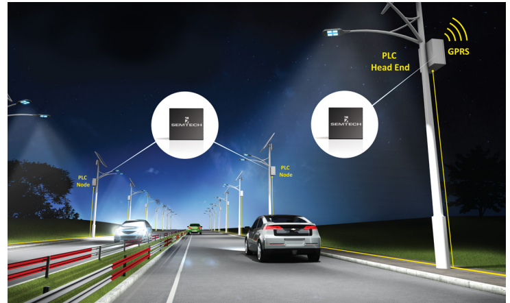
Street Lighting Network