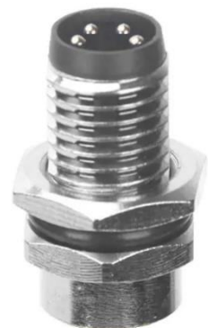
4 pin male connector