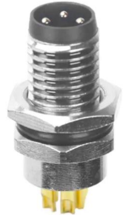
3 pin male connector

IP67 M8 straight shielded PCB Panel Mount 3 or 4 pin A coded connector. Designed for Sensors, actuators, and industrial controllers. 8mm threaded joint, quick easy mating and locking, even in places difficult to reach. Anti-vibration locking design.