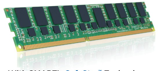
With SMART's SafeStor™ Technology