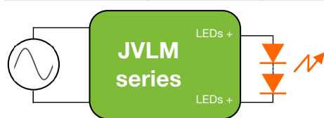
Typical Application Diagram