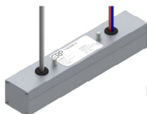
Models with "-S" Suffix, Bottom Leads with Studs, Aluminum Case:

L 137 x W 26.25 x H 19.85 mm (L 5.39 x W 1.03 x H 0.78 in)