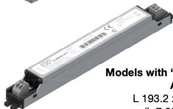
Models with "-T" Suffix (Terminal Blocks), Aluminum Case:

L 137 x W 26.25 x H 23.85 mm (L 5.39 x W 1.03 x H 0.94 in)