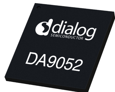
VFBGA 7 mm x 7 mm, 0.5 mm pitch package

An integrated 10-channel general purpose ADC includes support for a touch screen controller with pen down detect, programmable high/low thresholds, an integrated current source for resistive measurements, and system voltage monitoring with a programmable low voltage warning. The ADC has 8-bit resolution in auto mode and 10-bit resolution in manual conversion mode.