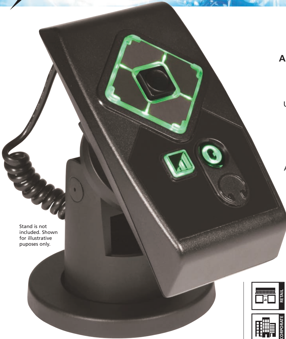
Stand is not included. Shown for illustrative purposes only.