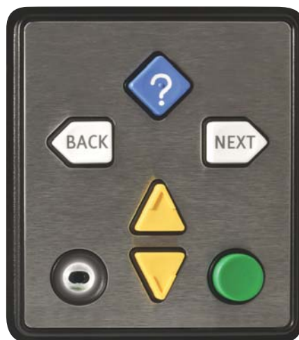
6 Keys with integral USB interface