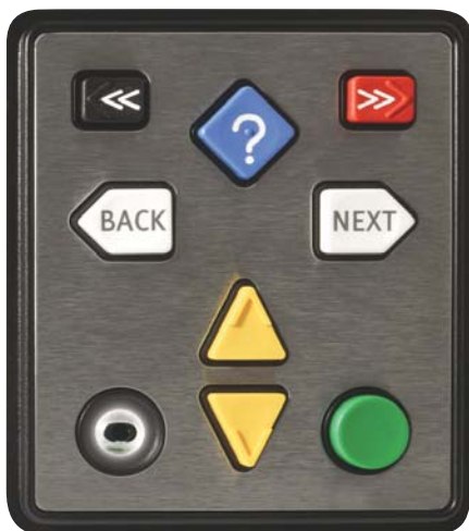
8 Keys with integral USB interface

with audio processor and illuminated audio jack socket