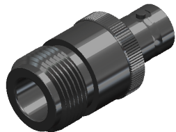
ISOMETRIC VIEW FULL SCALE