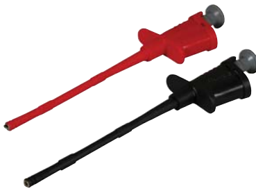
CT2489 (see model numbers above)

Specifications and appearance subject to change without notice P240100_r01