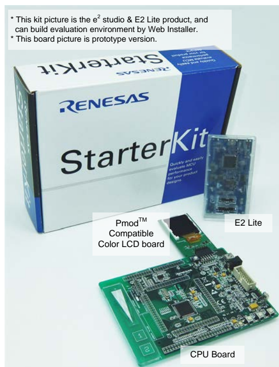
Figure 1 e 2 studio Edition (A dedicated installer disk comes with the CS+ Edition.)

The kit includes all the following hardware and software necessary for development, for immediate evaluation of the RX130.