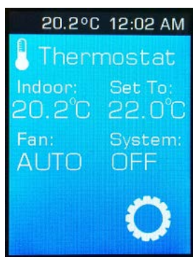
Figure 3 PK-S5D9 thermostat demonstration

In this demonstration, the SSP uses the A/D converter to read the internal temperature sensor of the MCU and displays this information on the LCD display shown in Figure 3.