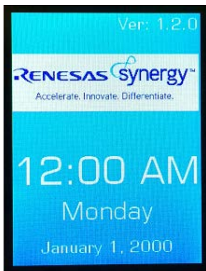
Figure 2 PK-S5D9 splash screen

Once the PK-S5D9 is plugged in, it powers up and performs a self-test. After the test, the LCD displays a splash screen as shown in Figure 2.