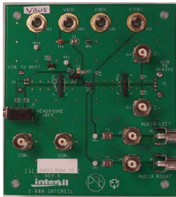
FIGURE 1. ISL54210EVAL1Z EVALUATION BOARD