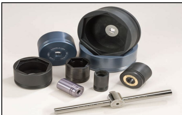
DMC1358 COMPOSITE JAM NUT TOOL KIT

The correct application of torque is essential to most connector applications where Jam Nut receptacle connectors are used. The sealing components (usually an "O" ring) must be compressed, but not to the point of damage. Another important consideration when tightening Jam Nuts is the thread strength, especially in the various types of aluminum and composite connectors.