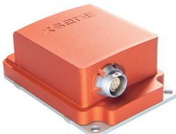
MTi encased: 57x42x23.5 mm, 52g, 9-pins push-pull connector