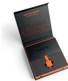
MTi 10-series Development Kit: MTi, software and cabling