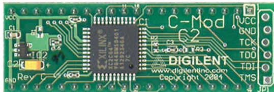
The Cmod board.

Cmod boards combine a Xilinx CPLD, a JTAG programming port, and power supply circuits in a convenient 600-mil, 40-pin DIP package. Cmods are ideally suited for breadboard or other prototype circuit designs where the use of small surface mount packages is impractical. All Cmod boards include: