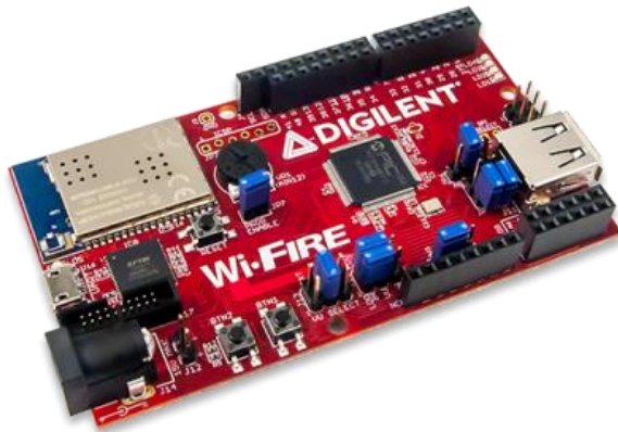
The Wi-FIRE board.