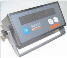
Desktop or Support Mounting Arm