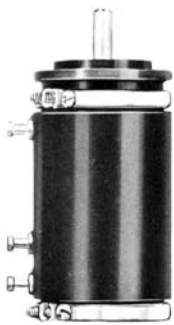
SERVO MOUNT/BALL BEARING MODEL 3207