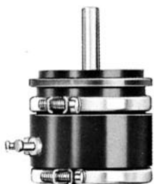
SERVO MOUNT/BALL BEARING MODEL 1201