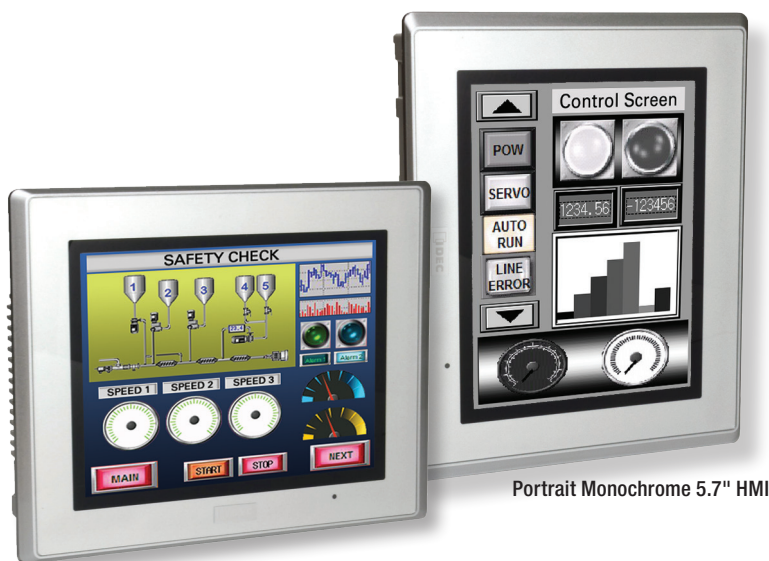
Landscape Color 5.7" HMI