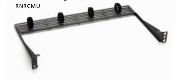
Rear Cable Manager RNRCMU