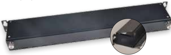
Secure Enclosure RNSE1U