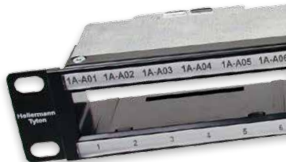
RNG Series Shielded Modular Panel RNGSPP1U