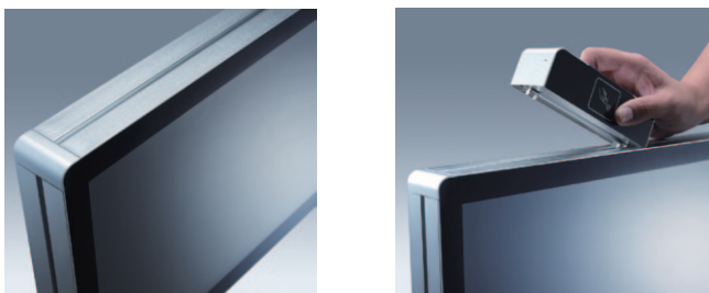
Side groove design for Flexible peripheral device